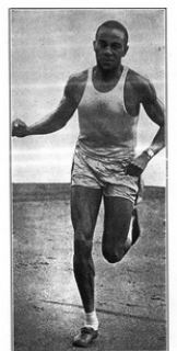
PHIL EDWARDS Hamilton Olympic Club, considered one of the fastest half milers in competition. 5 th Time Olympic Medalist