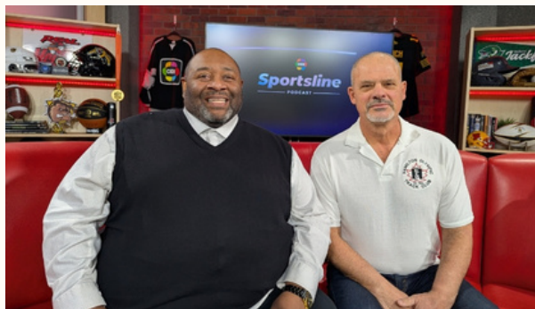
CLICK HERE for the CHCH Sportsline Podcast

The HOC have been guests on CH Sportlines Podcast, Cable 14, and CH Morning, talking about track, history, and club operations today. To View click on links below: