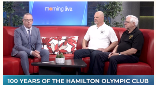
CLICK HERE for the CHCH Morning Live Segment